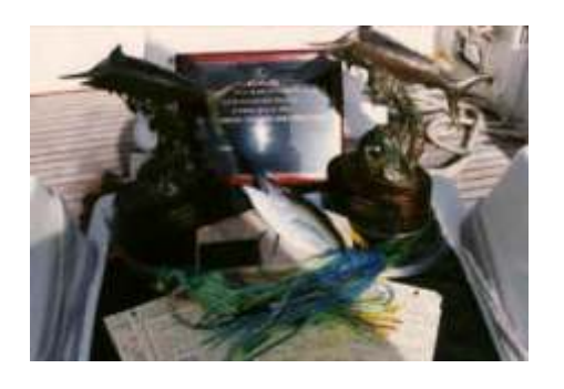
Slams in New South Wales in just one week.

Around 90% of Pakula Lures are exported to countries including Hawaii. mainland USA and South America, all Pacific Island groups including Singapore, Malaysia, Indonesia, Guam, Tahiti and Japan. Pakula Lures have won the major tournaments in all of them. The largest: Black Marlin, Blue Marlin and Sailfish records in both New Caledonia and Vanuatu, Blue Marlin in Lord Howe Island; Black Marlin in New Zealand and the largest Black and Blue Marlin in 1994; the largest Yellowfin (91 kg) ever on a lure in Australia; the largest Blue Marlin (297 kg) in Sydney waters and many more. Pakula's also account for the most of one species on lures in a single day; 16 Sailfish (Mooloolaba); 6 Blue Marlin (Gold Coast); 12 Blacks (Moreton Bay) and 14 Striped Marlin (N.S.W.). To top this off, Pakula's accounted for 3 Grand