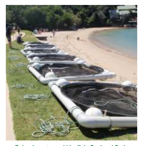
Releasing a tagged kingfish; Paul and Craig setting up the cages used to hold the angled-and-released kingies.

Of the tagged gill-hooked fish, one was detected motionless within 10 minutes and another last detected seven minutes after release; both presumed dead. In contrast, none of the mouth-hooked fish died within the first 24 hours. All surviving fish behaved quite similarly.