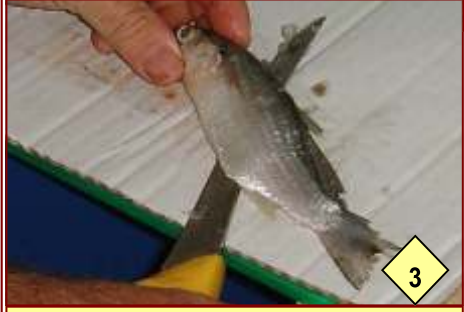
STEP THREE: Cut a little further forward along the backbone towards the head approx 25mm.