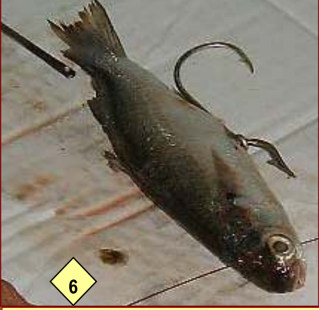
STEP SIX: Insert from the top your wire leader through the hook eye and out the gills place on sinker.