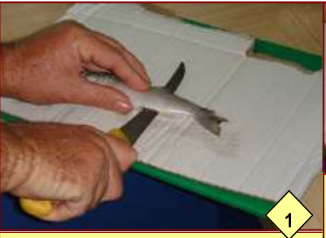
STEP ONE: With a sharp thin bladed knife, insert at the anal vent and back towards the tail along the backbone