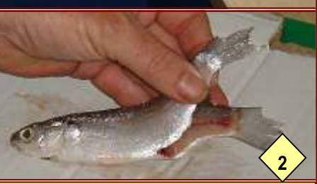
STEP Two: Tilt the knife at 45 degrees