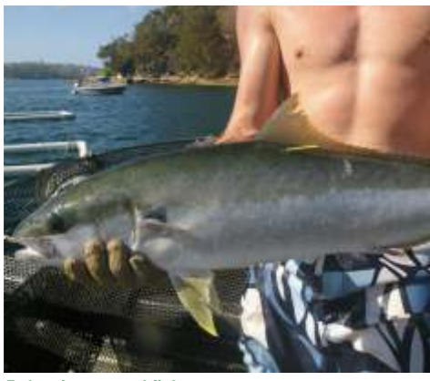
L-R: Water-filled slings were used to transfer kingles from boats to the cages; Releasing tagged fish.

Immediately after being released, most swam to mid water, or within one metre of the seabed at accelerations of 2.5–3 knots, but remained very close (less than 500m) to where they were released.