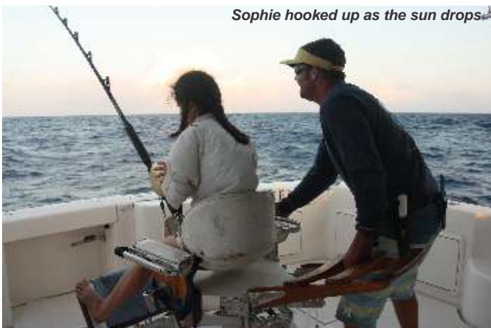
Sophie hooked up as the sun drops