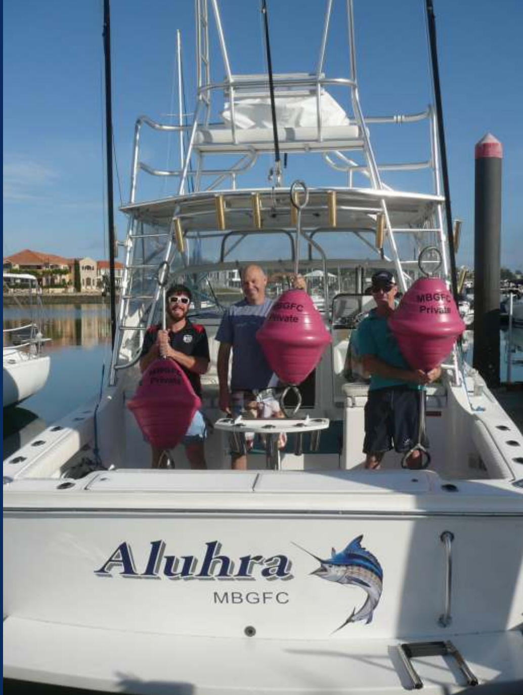
Club members laying new mooring buoys at the Moreton Island club house.

BRIAN KIRKBY 3822 2525 0412 784 622 nutec@pigpond.net.au GREG CUFF 3206 9104 0412 745 854 gregoryc1@tpg.com.au