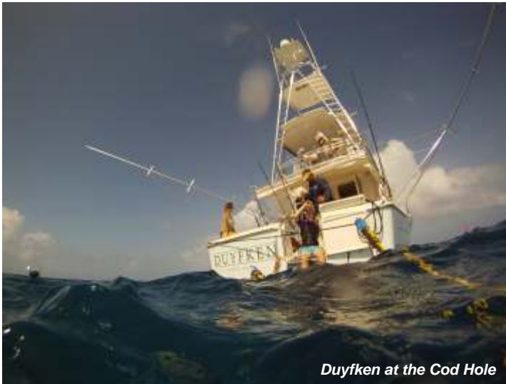
Duyfken at the Cod Hole