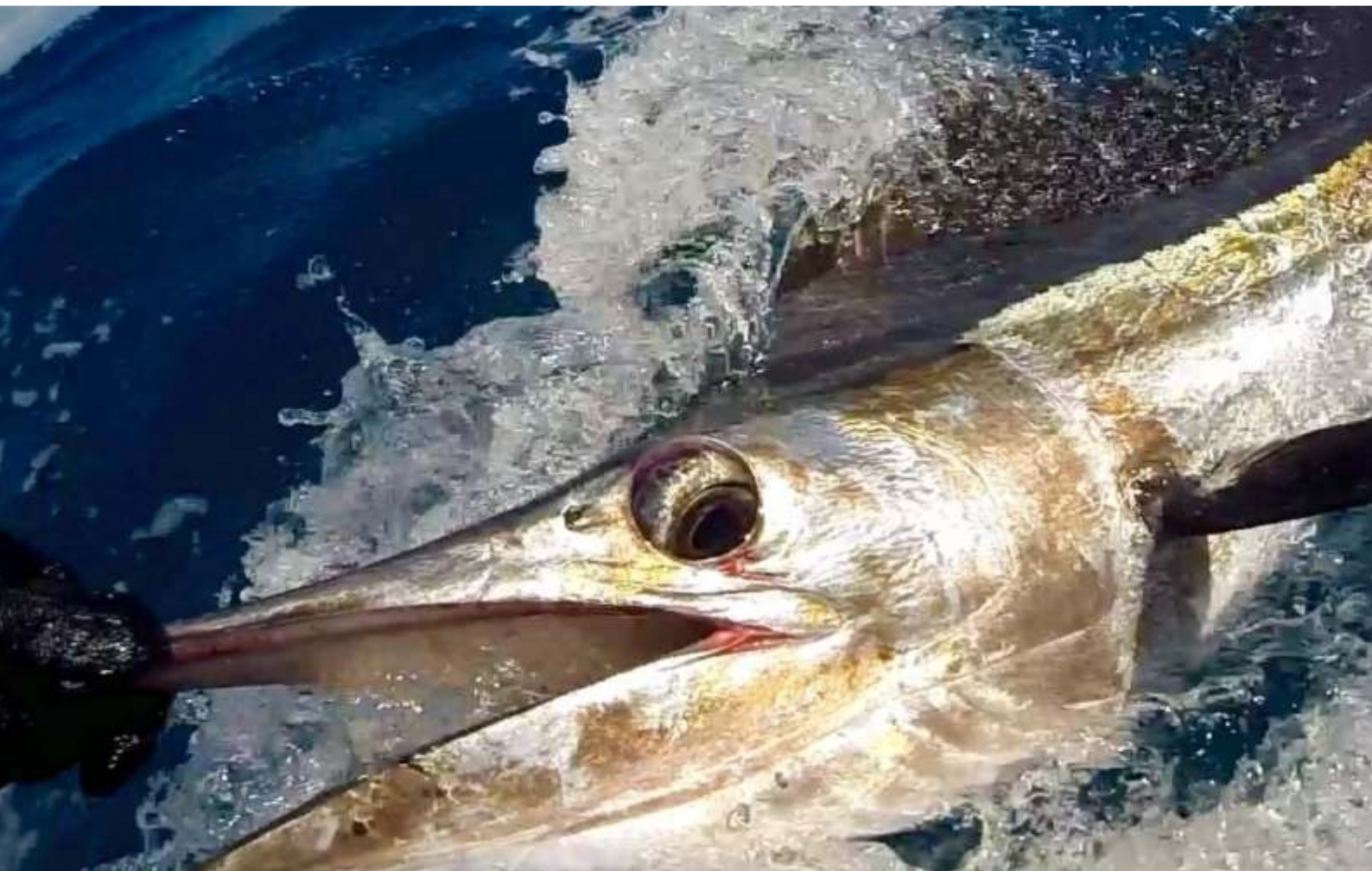
Sailfish Head Shots